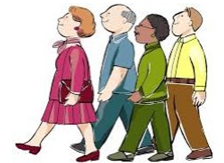
Calling All Seniors!

WE WANT TO HEAR FROM YOU! YOUR OPINION MATTERS.